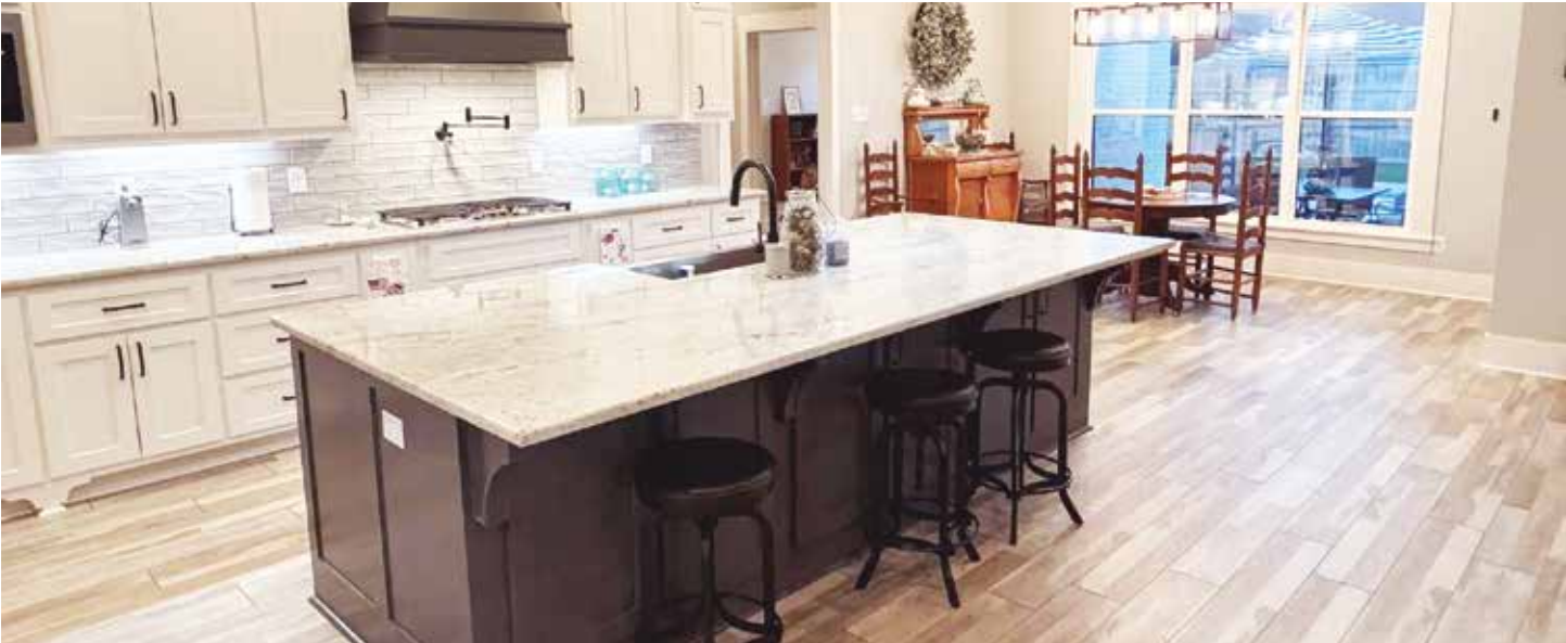
This 5-bed, 3-bath home on Lainey Drive in Conway was the most expensive home sold in Faulkner County in January. It sold for $718,900 and $194.61 per square foot.