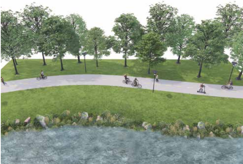
The Connect Conway initiative will establish a 15-mile greenway trail linking key landmarks.

Situated on 54 acres near Curtis Walker Park and Theodore Jones Elementary School on Museum Road, the facility will significantly expand the city's capacity for local and regional soccer events. With construction well underway, the city expects the first soccer season at the new complex to kick off this spring.