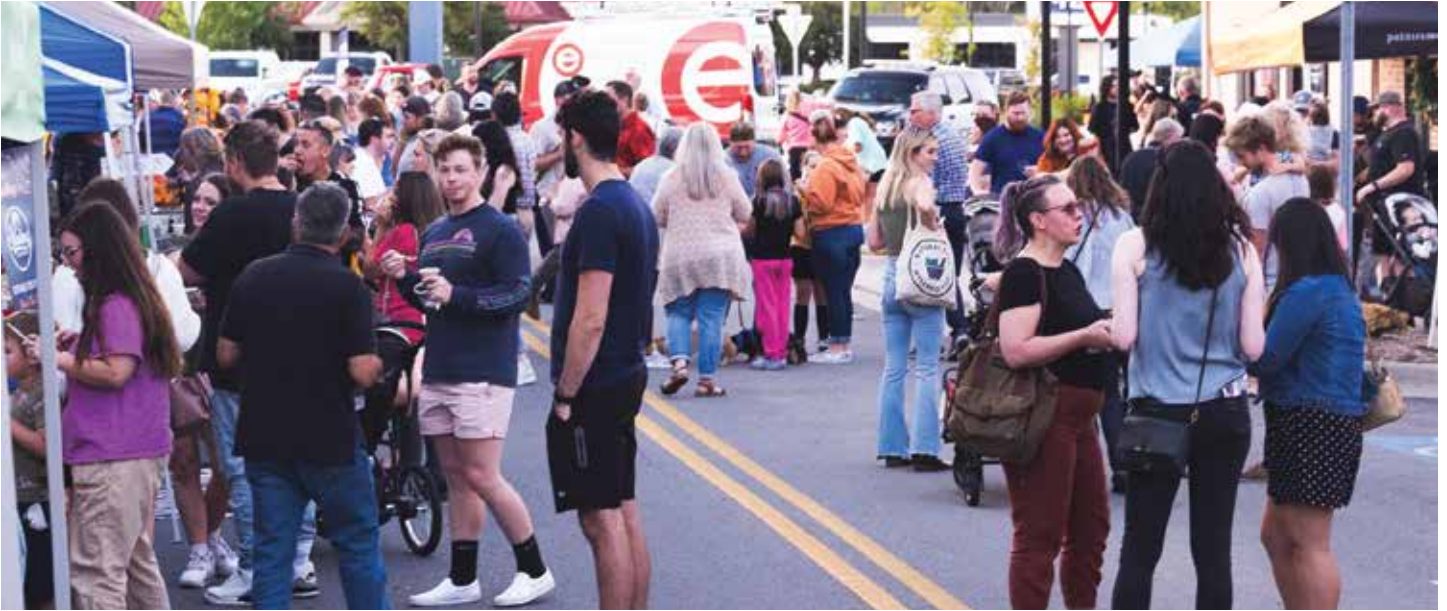
Conway's downtown entertainment district allows businesses to sell alcoholic beverages for consumption within the district during specific events. This provides an additional revenue stream for the city and encourages businesses to actively participate in the entertainment district.