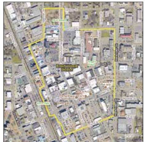
The district is home to a variety of establishments, including restaurants, bars, and entertainment venues, creating a walkable and inviting space for visitors to explore.

Moreover, the entertainment district is expected to invigorate the hospitality sector. Restaurants and bars within the district can expand their services by offering outdoor seating and hosting special events. The opportunity to socialize and enjoy a drink in a lively outdoor setting can attract more customers, leading to increased revenue and job creation. 🍷