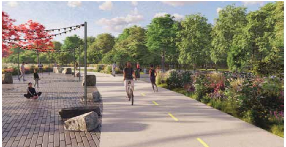
Connect Conway will integrate 10 parks, seven schools, three major retail districts, three universities, 14 key employment centers, and 16 neighborhoods into a cohesive transportation network.

Last year, the city completed phase two of the project, adding two pedestrian bridges that connect the plaza to Pompe Park's mountain bike trail and pump track. Further enhancements are on the way, as the Conway City Council approved funding in June for additional parking near Morningside Drive, improved trail connections, and a new restroom facility near the pavilion. These upgrades will ensure greater accessibility and usability for residents and visitors.