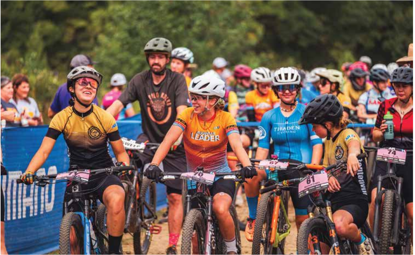
Conway has further expanded its recreational offerings with the addition of a new mountain bike trail at Meadows Technology Park in south Conway. The trail hosted two Arkansas National Interscholastic Cycling Association events in the fall, welcoming hundreds of riders from across the state.